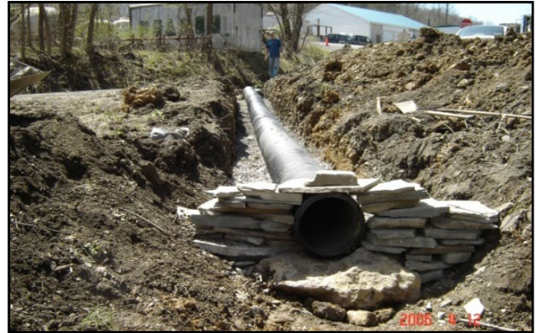
Photo 1. A plastic crosspipe is shown during installation. Notice the pipe bedding material, endwall, and stone at outlet.