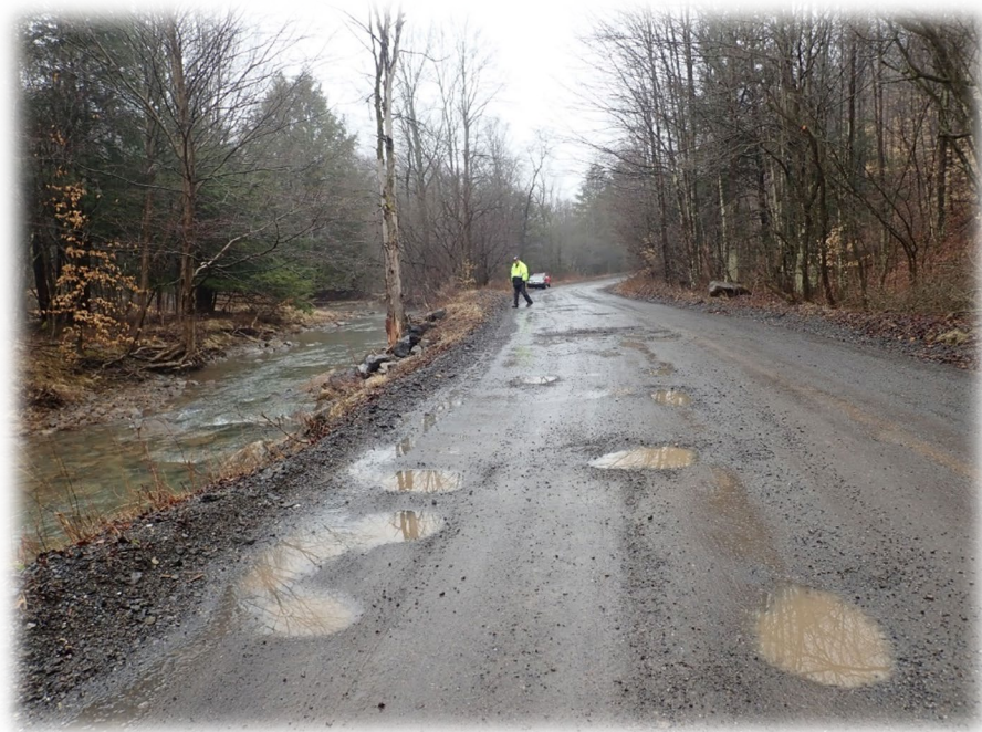
Before picture of cover photo project.